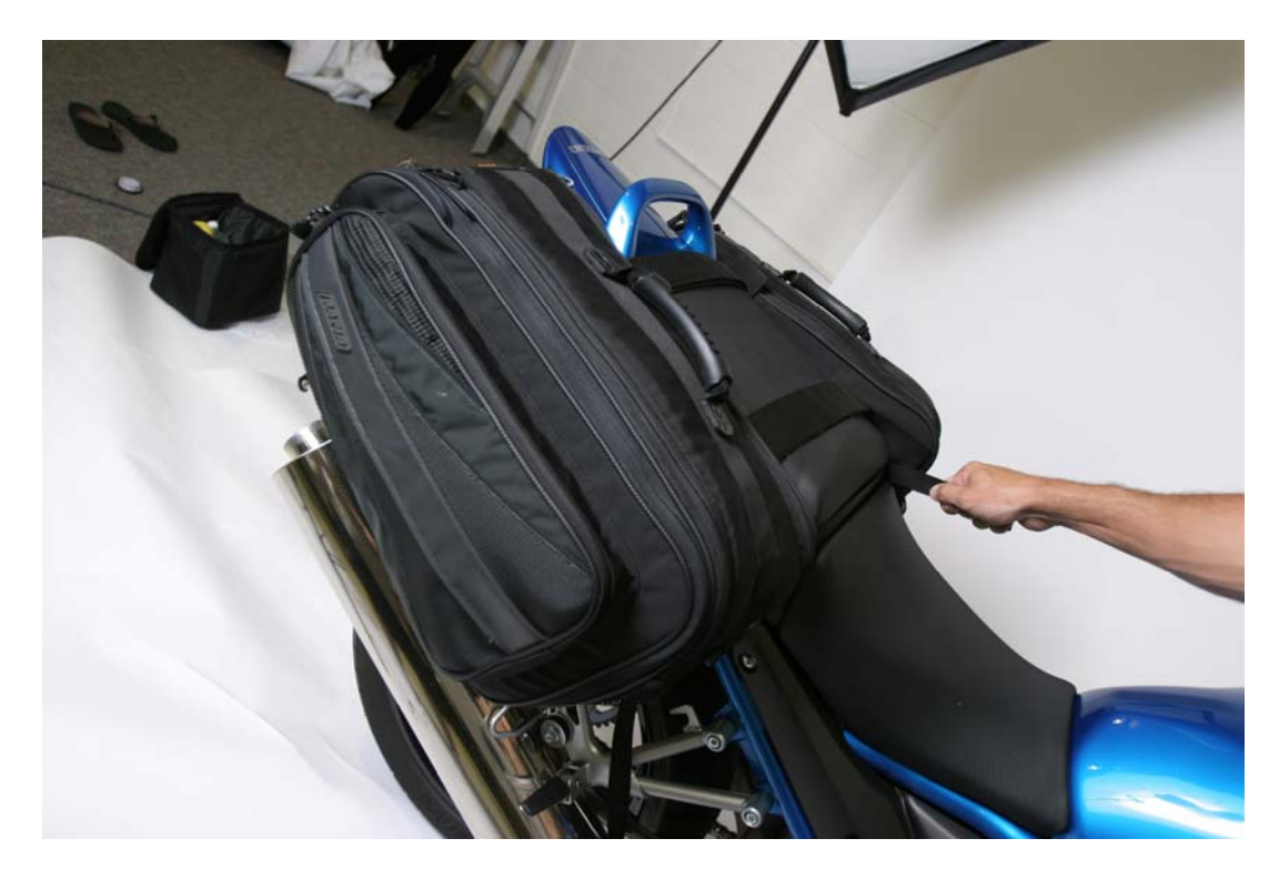
<u>Step 13:</u> Repeat step 11 for the other side.