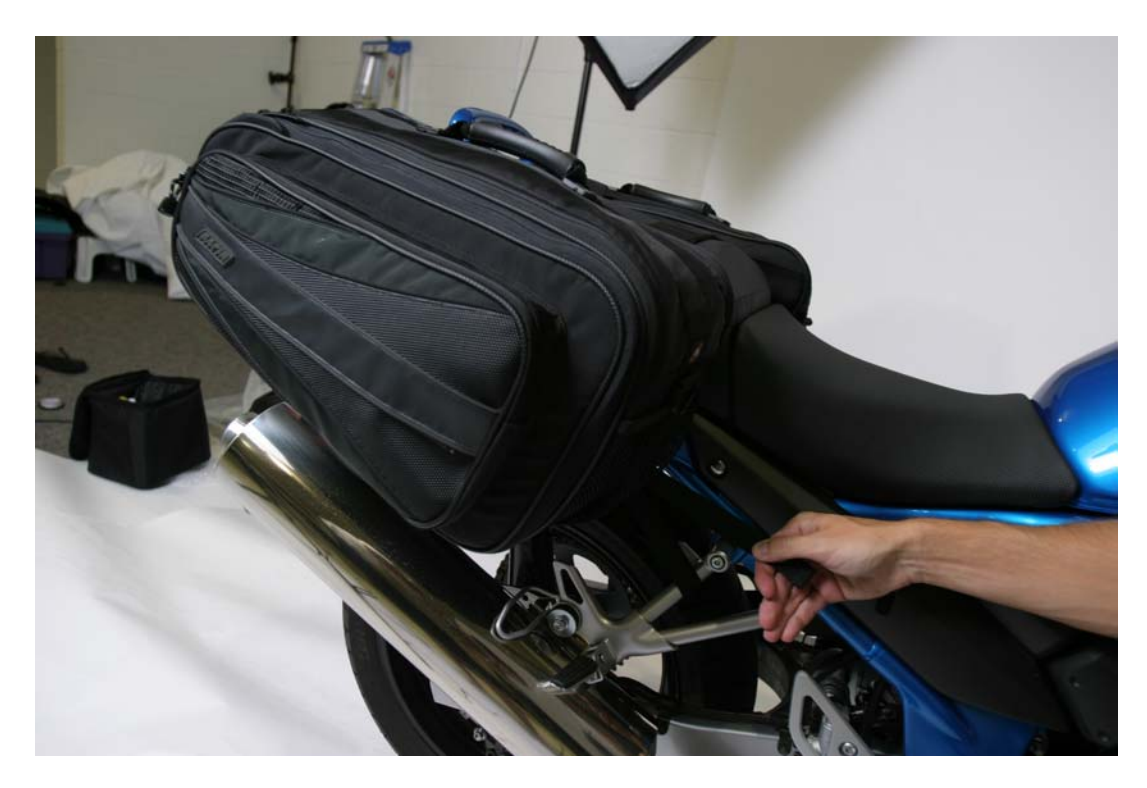
<u>Step 17</u> : Manage all excess strap and take care to keep it away from the rear wheel.