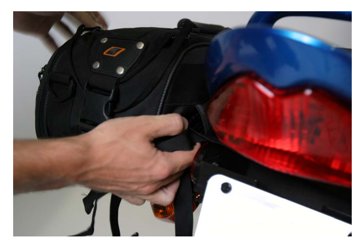
<u>Step 5:</u> Roll up excess strap length.

<u>Step 4:</u> Snap into the female clip under the protective cover.